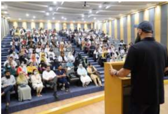
Youth Club Session on Best Version of Yourself

regarding the child. A multidisciplinary team comes into action which has a psychologist, occupational therapist, Speech language therapist and at times neurologist. They all play a significant role in helping the child. The psychologist uses the DSM 5 to assess the child's behavior and see if he/she meets the criteria of ASD. Two important criteria when assessing the child is his lack of social interaction and repetitive behavior which are the major red flags. The therapists also discussed what are the important assessments done by speech language therapists to suspect ASD and for giving out appropriate referrals.