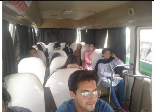
Example of Outside the campus Free of cost shuttle services available for students and staff's daily commute from their nearby areas to Ziauddin University Link Road site