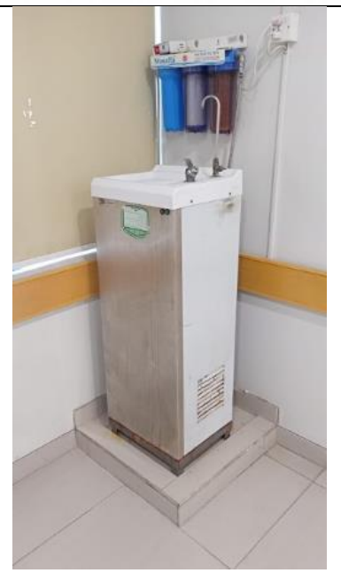
Clean drinking water facility free of cost