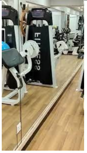
ZU Gym and Health and Wellness Centre