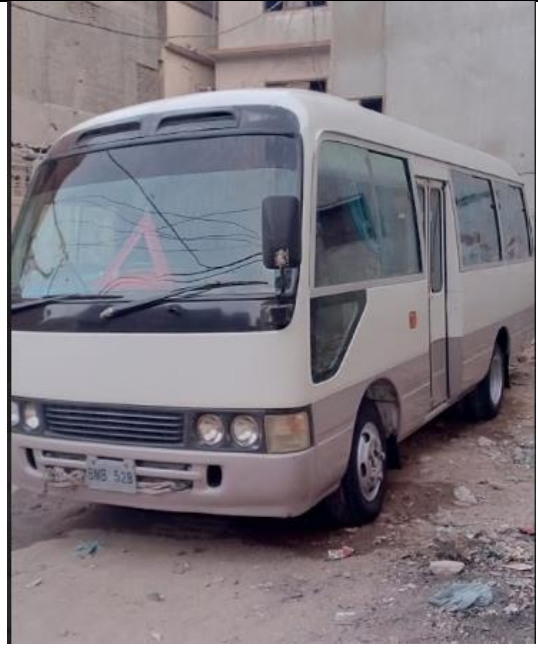
Shuttle service free of cost