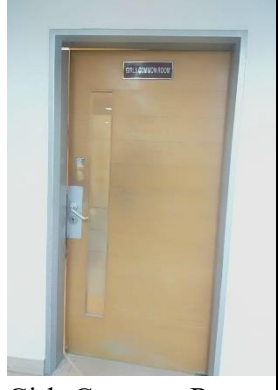
Girls Common Room