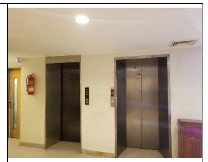
Elevators for Up and Down