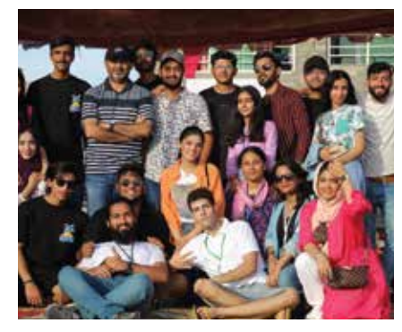
THE BEACH ESCAPE: A PICNIC ORGANIZED BY THE FLAHS STUDENT COUNCIL

Under the able guidance of the Office of Student Affairs, the President and members of the Student Council performed their tasks at par and made the event a memorable event for everyone. The event was covered by photographers to capture all the precious memories being made. It was a much-needed vacation for the students as well as the faculty who work tirelessly, day and night.